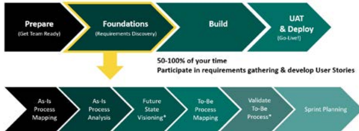
FIGURE 2: BUSINESS PROCESS OPTIMIZATION METHODOLOGY

On the first go-round, we introduced our proven Process Optimization Methodology (Figure 2) to Rush's BPM Teams as part of the Tell step of the training for the discipline required to perform process optimization work. Akili then took the facilitation lead, and all four of the BPM Teams participated side-by-side in a collaborative and highly interactive group learning experience as part of the Show step of the training. Rush's BPM Teams would adopt this methodology as the standard best practice for the new organization.